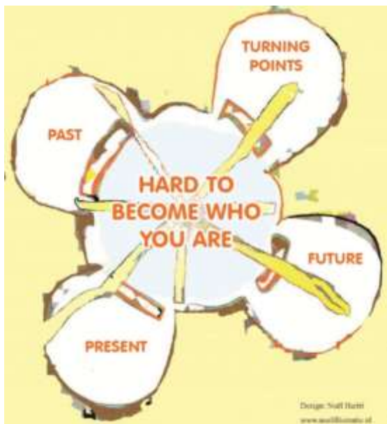
'FIELD OF VIEW'

It's crazy to write a book about the whole history of mankind in 250 pages. It's not so crazy because there are links to other sources as the film with the same name, music, images, social media, the To-Gather Game, YouTube, Mind Brain and Education, GLO-Maker and the hybrid reality. It's a satellite view, but it's also fine tuning of a specific spot, event or person. The emphasis is on the previous hundred years. During history it is hard to become who they are and this is also relevant for the youth of today in a chaotic, complex and turbulent world. Education is the best way to organize and energize knowledge about the past, the present and the future.. It's a challenge to know and find an own place in turning points such as new economy, new technology, isms, human rights and a past that's no history (see 'Field of View'). dramaturgical consciousness (Jeremy Rifkin).