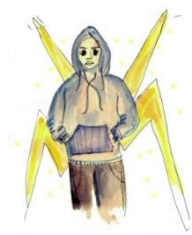
Django: jihadist from London Battle and Drillrap