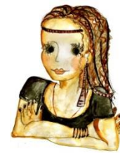
CHillak: alternative young woman from Ljubljana Postpunk and Avant Garde